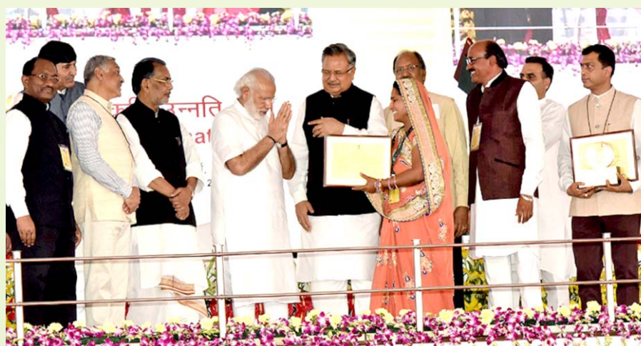
A farm-woman receiving Krishi Karman Award from Hon'ble Prime Minister of India, Shri Narendra Modi

Hon'ble Prime Minister also conferred Krishi Karman Awards to States and progressive farmers for the year 2014-15 for their