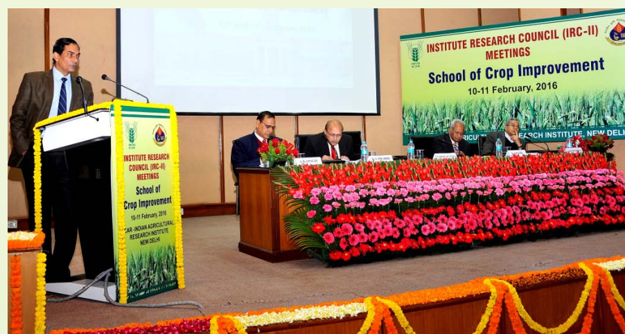
Institute Research Council (IRC-II) meeting