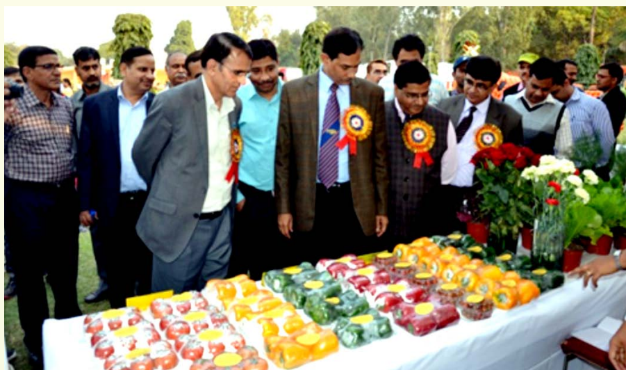
A view of Pusa Horticulture Show - 2016