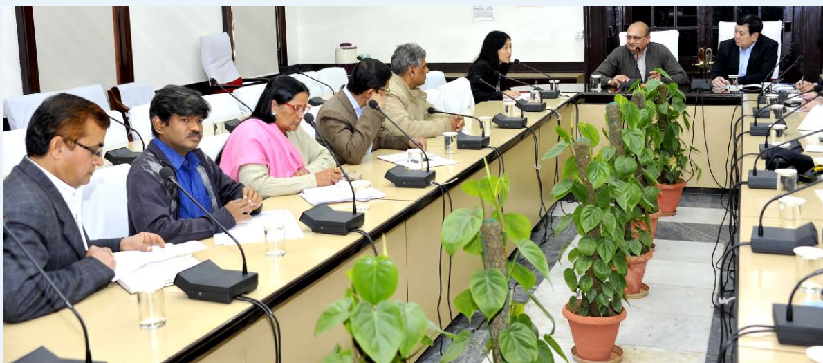
The Japanese delegation interacting with IARI team