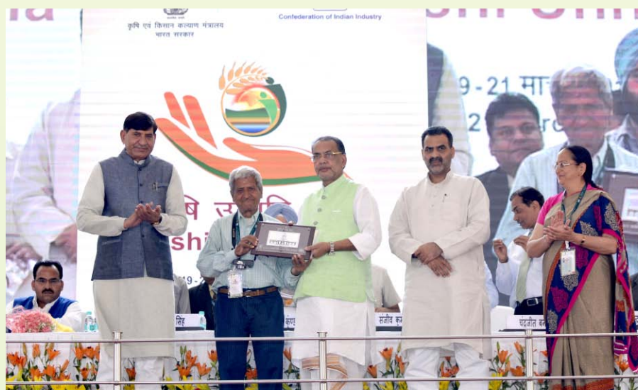
A farmer receiving Innovative Farmers' Award from Hon'ble Union Minister of Agriculture and Farmers' Welfare, Shri Radha Mohan Singh

The 54 th Convocation of the Post Graduate School of the Indian Agricultural Research Institute