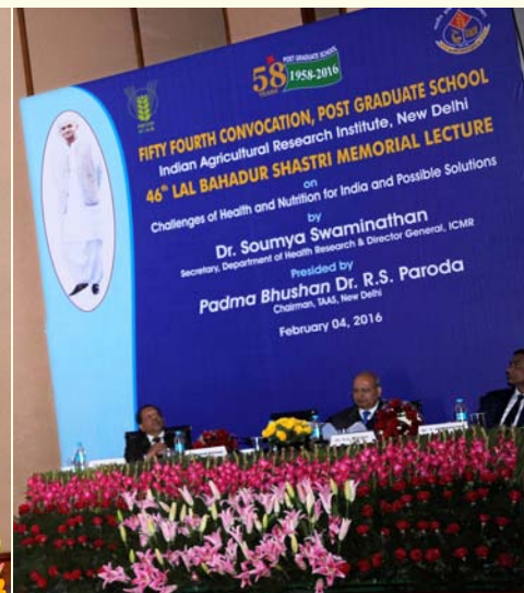
Dr. Soumya Swaminathan, Director-General, Indian Council of Medical Research, New Delhi delivering the 46 th Lal Bahadur Shastri Memorial Lecture