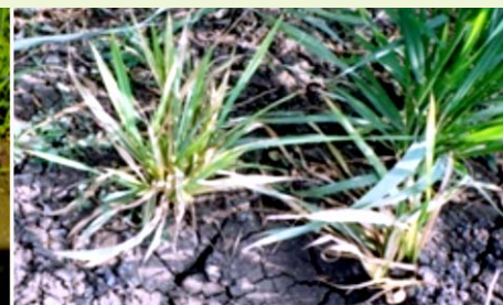
Leaf yellowing and stunting symptoms in durum wheat genotypes : HI 8713 (left) and PDW 233 (right)

Anthocyanins were known to possess high antioxidant activity. Anthocyanin rich powder was extracted with food grade solvent and purified to get anthocyanin rich powder. This was further encapsulated in food grade matrix to get antioxidant powder, which can be used for day to day use. Sources used for the extraction of anthocyanin were black carrot (Pusa Asita), purple cabbage, black rice, rose, china rose, etc. DPPH assay revealed that ED 50 of these