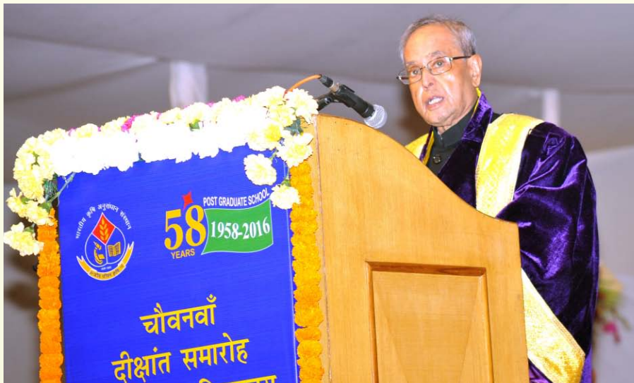
Hon'ble President of India, Shri Pranab Mukherjee delivering the 54 th Convocation address