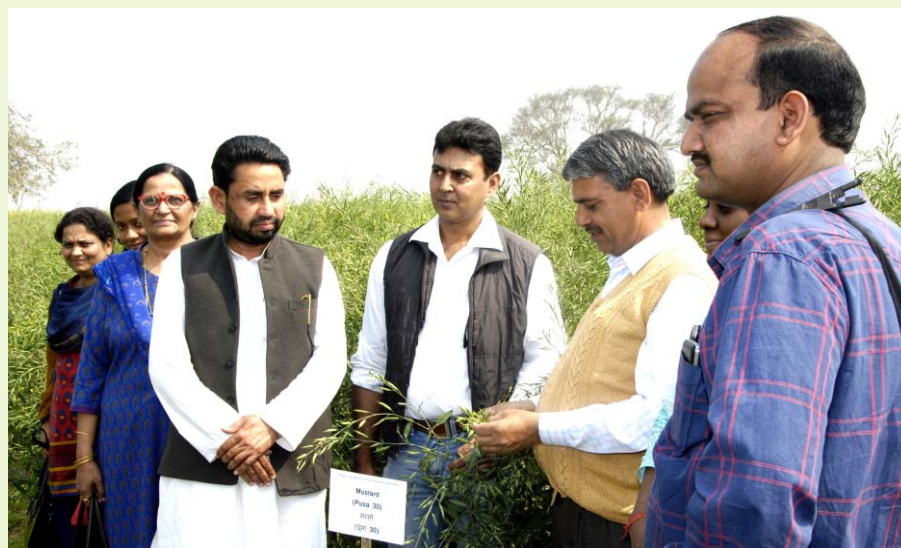
Scientists interacting with farmers while explaining importance of mustard variety, Pusa 30

The Institute organized carrot field day for private seed companies on February 24, 2016.