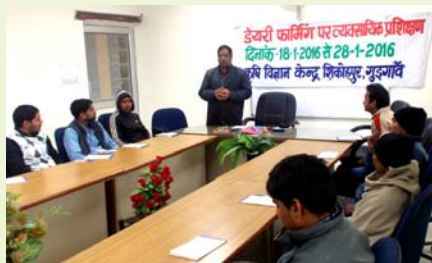
A training on "Dairy Farming" at KVK, Shikohpur

The Division of Plant Pathology conducted a training under CAFT on "Functional Analysis of Pathogenicity Genes of Plant