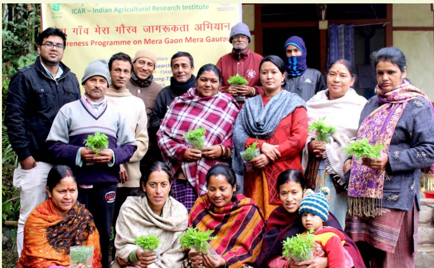
Distribution of tomato seedlings of Pusa Rohini variety during "Mera Gaon Mera Gaurav" programme

of varieties/hybrids, exotic vegetables and production systems developed by the Institute were demonstrated in the vegetable demonstration unit so that farmers and amateur gardeners can see themselves potential of technologies. An exhibition of various fresh vegetable products from divisional varieties/hybrids and scientific information about these were also displayed for the awareness about health and nutritional benefits as well as means of higher income and profit in shorter duration. Farmers from Delhi and neighbouring states of U.P., Haryana, Rajasthan, Punjab, Himachal Pradesh and Uttrakhand participated in large number, highest ever before (around 700) in the Mela. Other attractions of the Mela were vegetable seed sale counters, Biofertilizers, Post Harvest Products, etc. Literature on package of practices was made available to farmers and amateur gardeners.