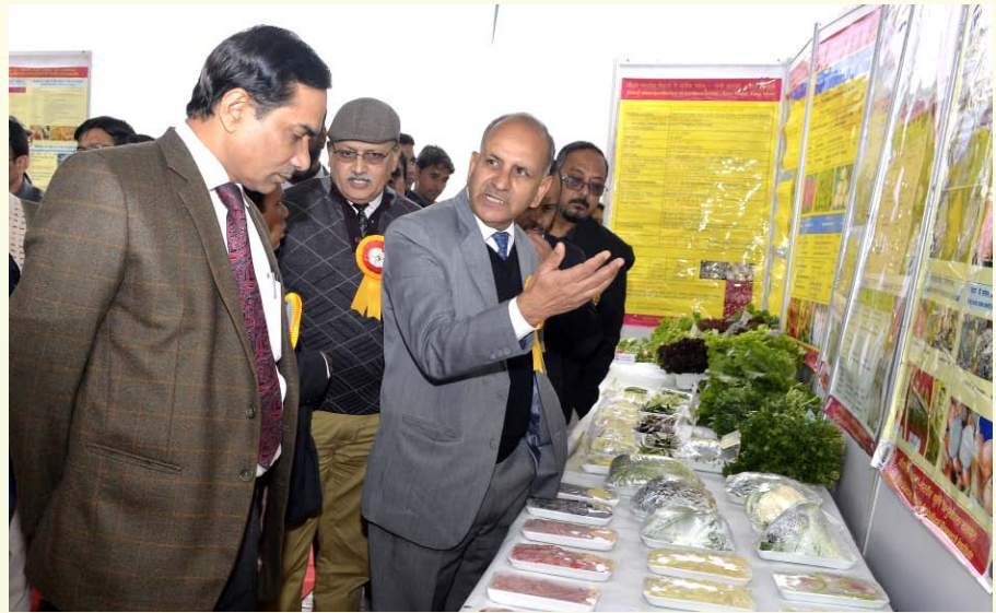
A view of Pusa Sabzi Vigyan Mela - 2016 held at IARI