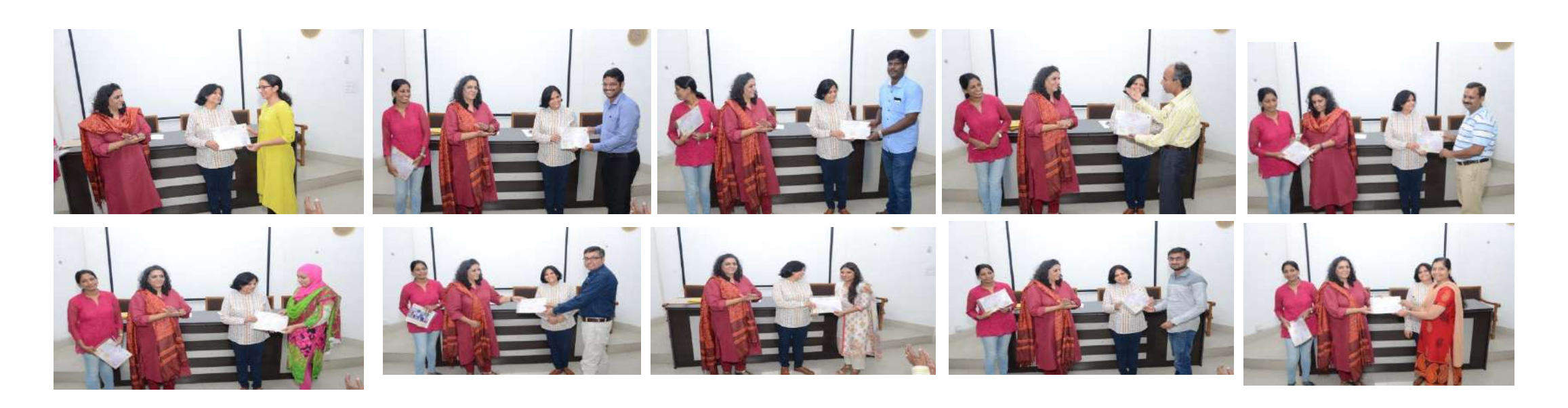
Distribution of Certificates to trainess during valedictory function, September 18, 2017