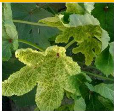
Centre of Advanced Faculty Training Division of Plant Pathology ICAR- Indian Agricultural Research Institute New Delhi-110012