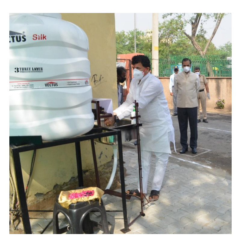
Sh. KailashChaudharyji MOS, MOA&FW sanitizing hands before inauguration of Pusa Decontamination and Sanitizing Tunnel