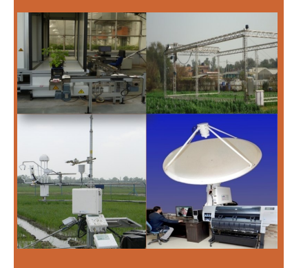
Monitoring crop growth and GHG emissions