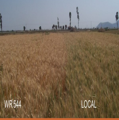
Experiments in research fields and Demonstrations in farmers' fields

Assessments on regional impacts and adaptation gains