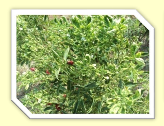
Sponsored by: Indian Council of Agricultural Research, New Delhi