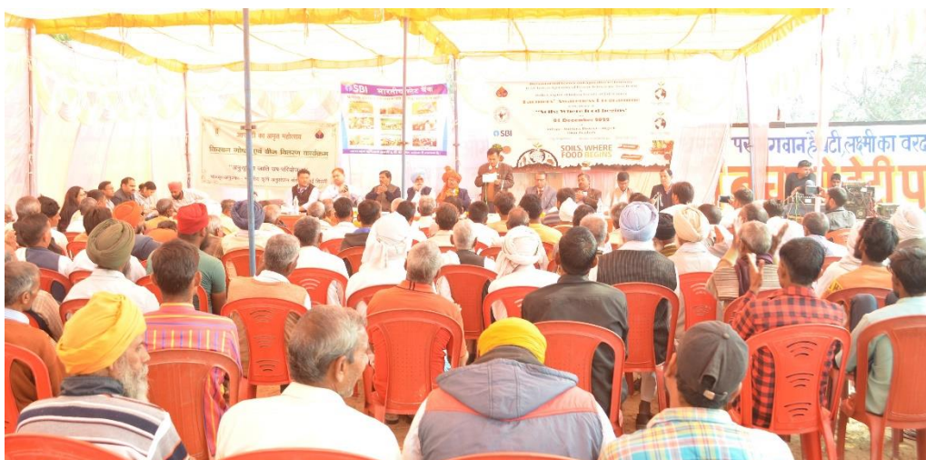
Farmer awareness programme on “Soils: Where food begins” held at Rajpura village, Aligarh on 1st December, 2022