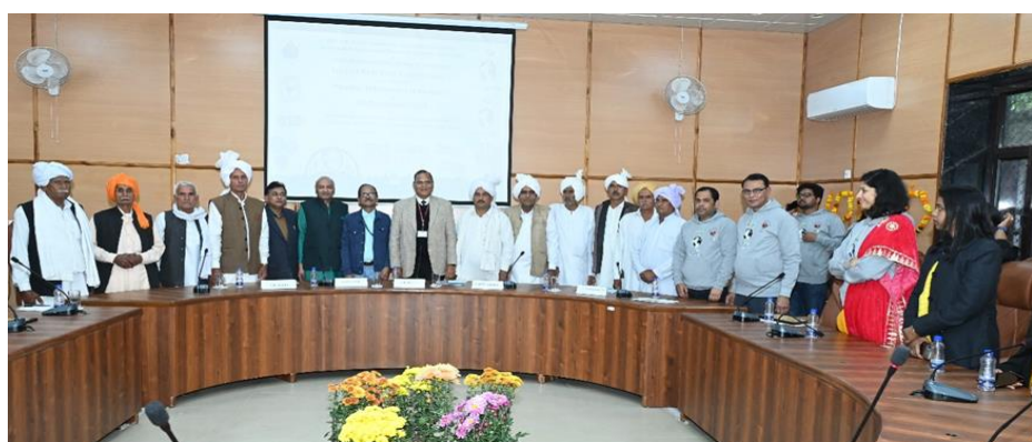
Director, ICAR-IARI along with Gram Pradhans of Sonapat district and Scientists on World Soil Day, 5th December, 2022