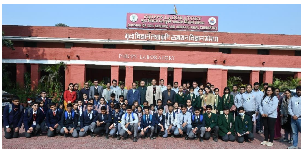
Director, ICAR-IARI along with Scientists and School children on World Soil Day, 5 th December, 2022