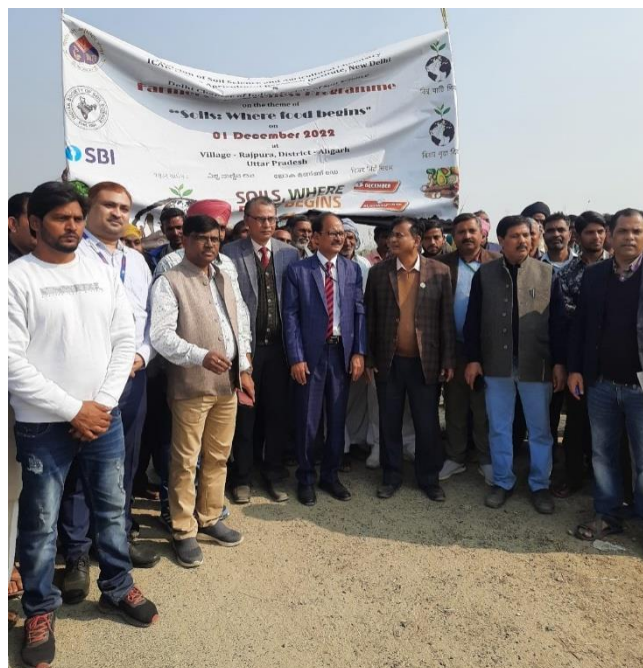
Farmer awrness rally on World Soil Day held at Rajpura village, Aligarh 1st December, 2022